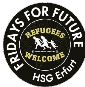
Hochschulgruppe Fridays for Future Erfurt