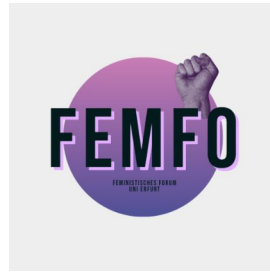
Feministisches Forum Erfurt