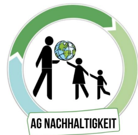
Arbeitsgruppe Nachhaltigkeit Erfurt